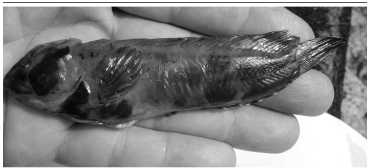
Fig 1. Freshwater blenny Salaria fluviatilis (TL=122 mm) caught on 17 May 2020 in the lower Neretva River in Bosnia and Herzegovina