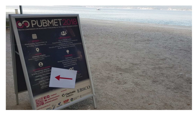
Fig 1. Announcement and signpost for the 5th PUBMET2018 conference in Zadar, Croatia

It is important to constantly strive to improve our scientific journal, so participation in conferences through which we gain knowledge about scientific research publishing and promoting the Journal is essential. Croat J Fish attended the 5th PUBMET2018 conference which was held in Zadar, Croatia on 20-21 September 2018 (Fig. 1). The themes of the conference were mostly focused on openness (open science, open data, open scholarly communication, open repositories, open peer review), publication and editorial practices, authorship and copyright, plagiarism and ethical issues, advances in digital scholarly publishing, bibliometrics, altmetrics, with the aim of bringing together a diverse community of researchers, university teachers, publishers, editors, librarians/information specialists, policy-makers, as well as experts from other fields of research and development. Also, there was discussion on development, current trends and accepted standards of scientific publishing, which is one of the basic prerequisites for the advancement and development of European and world scientific journals. The conference