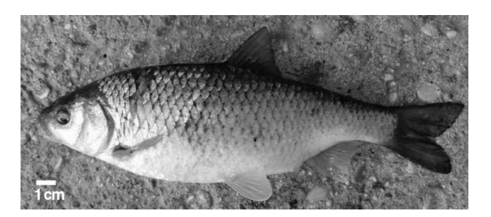
Fig 1. Neretva roach Rutilus basak (Heckel, 1843), 220 mm TL from the Hutovo Blato wetland, Bosnia and Herzegovina (photo by Nikola Zovko, January 2017).

In Croatia, R. basak is distributed in lakes and small rivers