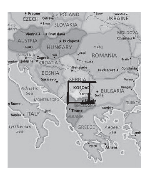
Fig. 1 Location of Drini i Bardhe River and the sampling stations Slika 1. Lokacija rijeke Bijeli Drim i mjesta uzorkovanja, GIS data from Dep.of Geografy, University of Prishtina